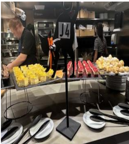
The JIV Cat was ready for dessert