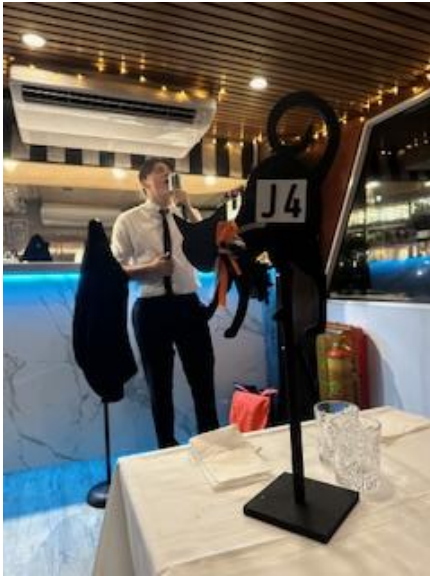
Our own crooner and he was great and the JIV cat enjoyed his songs