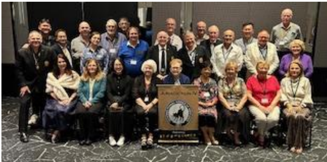
Delegates and guests for the 54 th JIV Convention